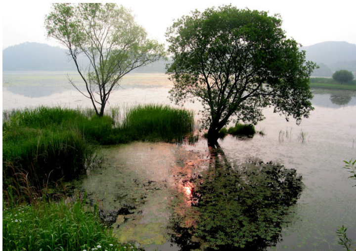
The Upo Wetland Ramsar site, Republic of Korea, (Photo courtesy Ha U Yeon)

During Ramsar COP10, parties adopted a decision on promoting international cooperation for the conservation of waterbird flyways (Ramsar COP 10 Resolution 22), which notes the intense pressure on intertidal wetlands in the East Asia-Australasian flyway and the outcomes of the International Symposium on East Asian Coastal Wetlands. In addition, during the Conference, the Government of the Republic of Korea reaffirmed its commitment not to approve any further large-scale conversion of intertidal wetlands.