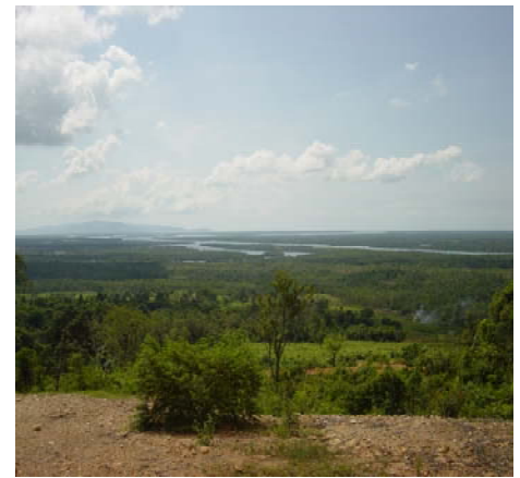
Mangroves in Cambodia

Environment, Denmark, assembled a considerable knowledge base on ICARM through case studies, pilot projects and guidelines. During 2003 and 2004 an ICARM Issue Paper and 12 ICARM Guiding Principles were developed. Additional outcomes from these joint activities include the development of progress markers for assessing development in linked management of river basins and coastal and marine ecosystems, which were published in: Ecosystem-based Management: Markers for Assessing Progress (UNEP/GPA, 2006). A case book including fifteen cases with different degrees of ICARM implementation has also