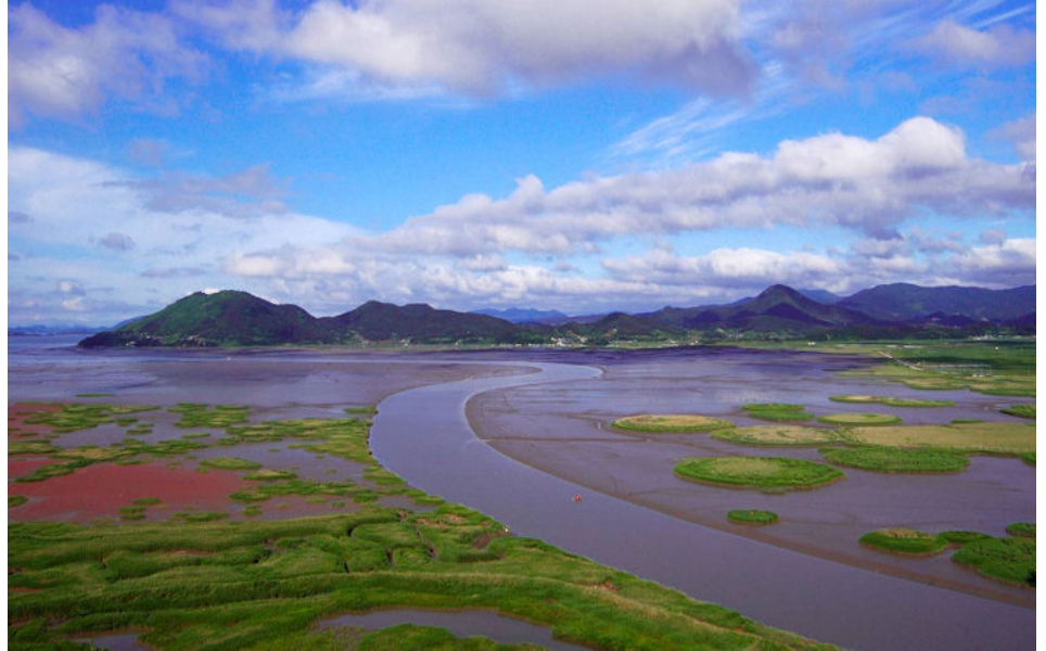
Suncheon Bay Ramsar site, Republic of Korea, (Photo courtesy Suncheon-si)

The intertidal wetlands and associated habitats of the Yellow Sea Ecoregion are of global importance for biodiversity conservation , with outstanding economic, cultural and landscape values.